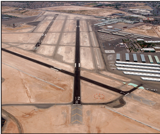
View from short final Runway 12R