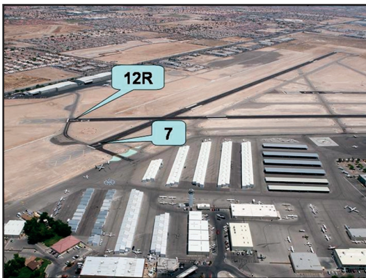
View from abeam the numbers on right downwind Runway 12R